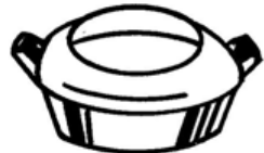
Aluminum Cookware with Induction Disc