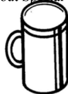
Cookware with a Diameter of Less Than 4.5"