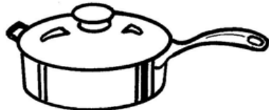
Copper, Bronze Or Aluminum Cookware