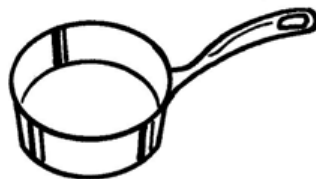
Bowl Shaped Cookware