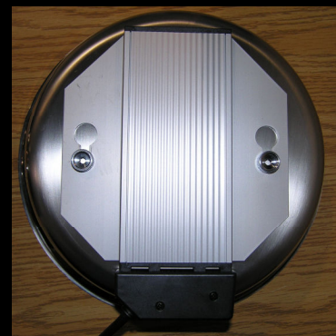
#621-66/WE Water Pan with 2-Bolt #9520 Electric Heating Element

* When using an Electric Heating Element, cabinet ventilation must be provided. The inside temperature of the cabinet must not exceed 90°F / 32°C.